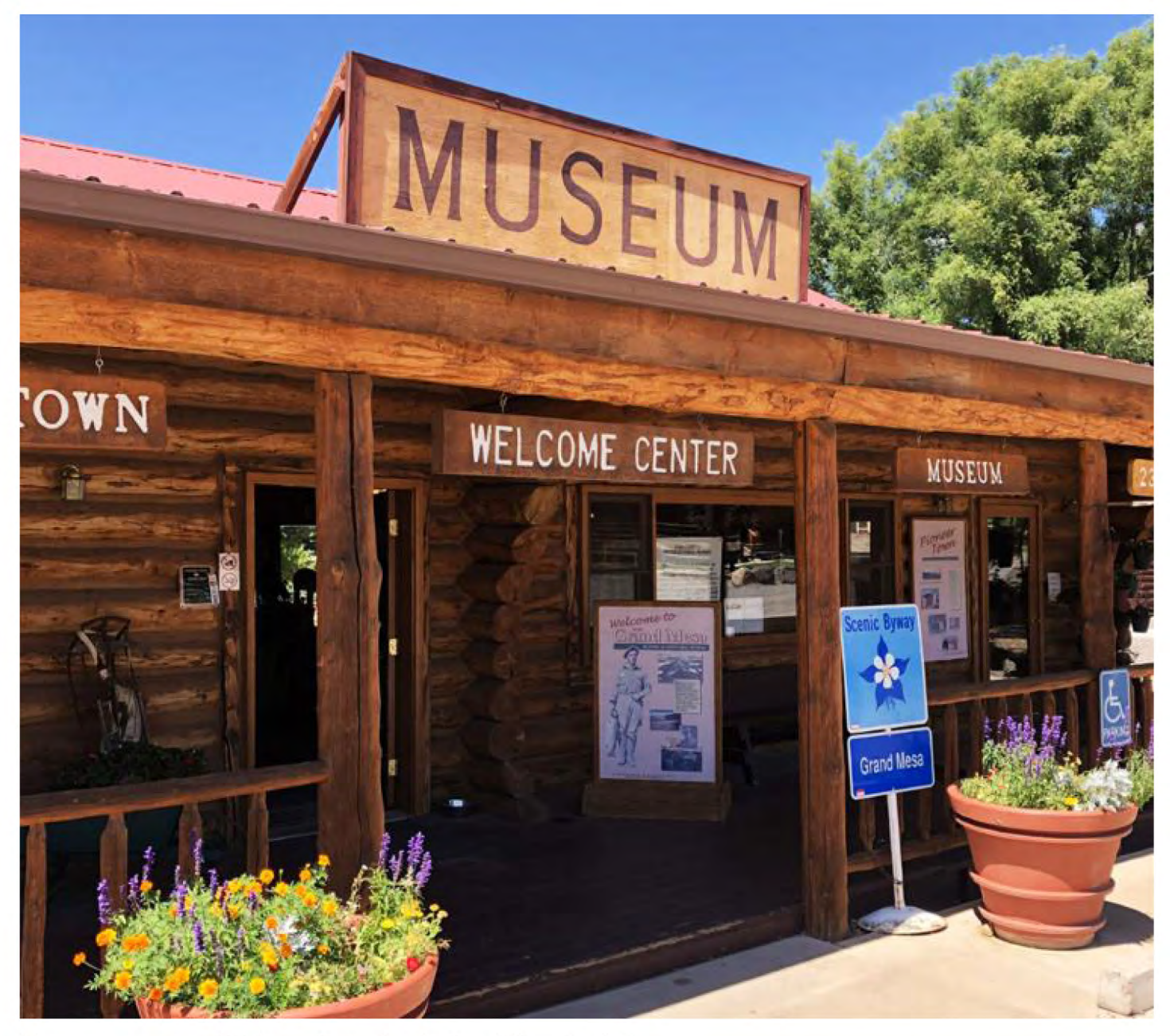
Museum entrance and Welcome Center for the Grand Mesa Scenic Byway

This comprehensive collection of artifacts and recreated buildings offers a unique experience to spend a day in the past and marvel at the life of the early pioneers of Surface Creek. Through the generous donations of many community members over several years, the museum has become one of the finest historical exhibits in Western Colorado. An unparalleled, hands-on experience awaits any wouldbe time travelers. All you have to do is step inside.