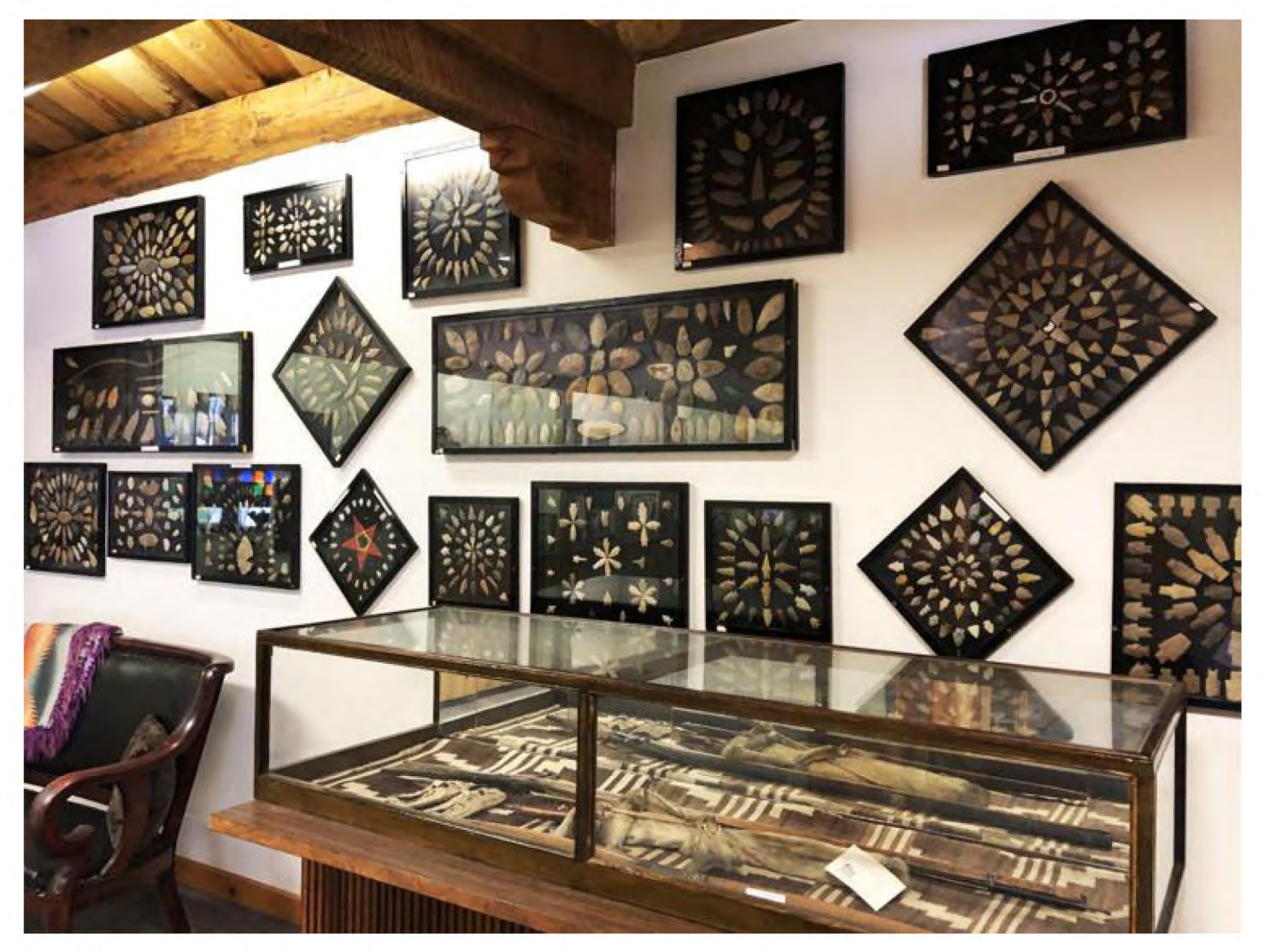
Part of the extensive arrowhead collection in the Sutherland Indian Museum

Down the street, the Charles States Museum shouldn't be missed. Here you can see a variety of displays from locally crafted needlepoint to dinosaur footprints found in the area, one of which is in the running for the largest ever found on record. The Girling Mercantile is fun to tour and you will marvel at the thought of squeezing a foot into the narrowest of shoes displayed there.