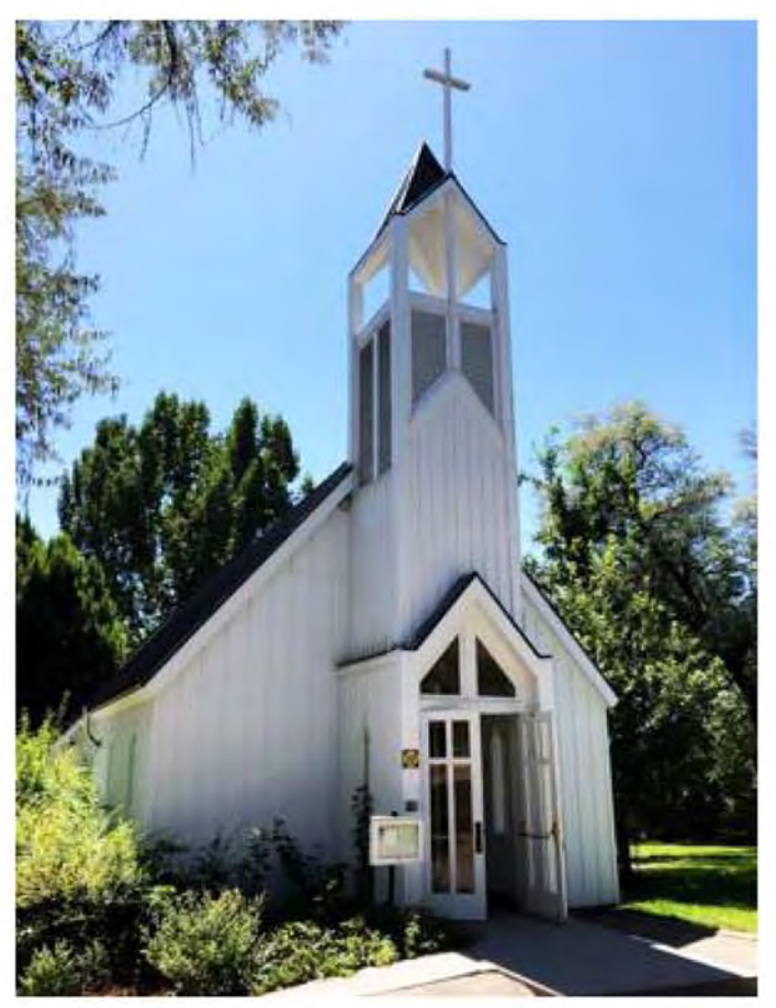
Chapel of the Cross Church

The award-winning Chapel of the Cross is a simple, but beautiful church, built in prairie style architecture, and is situated in a park-like setting. It is an ideal place for a memorable event. Together with the Stolte Shed, an original packing shed that was relocated from the Stolte orchard, the buildings present the perfect venues for weddings and receptions. Both are available for rental year-round.