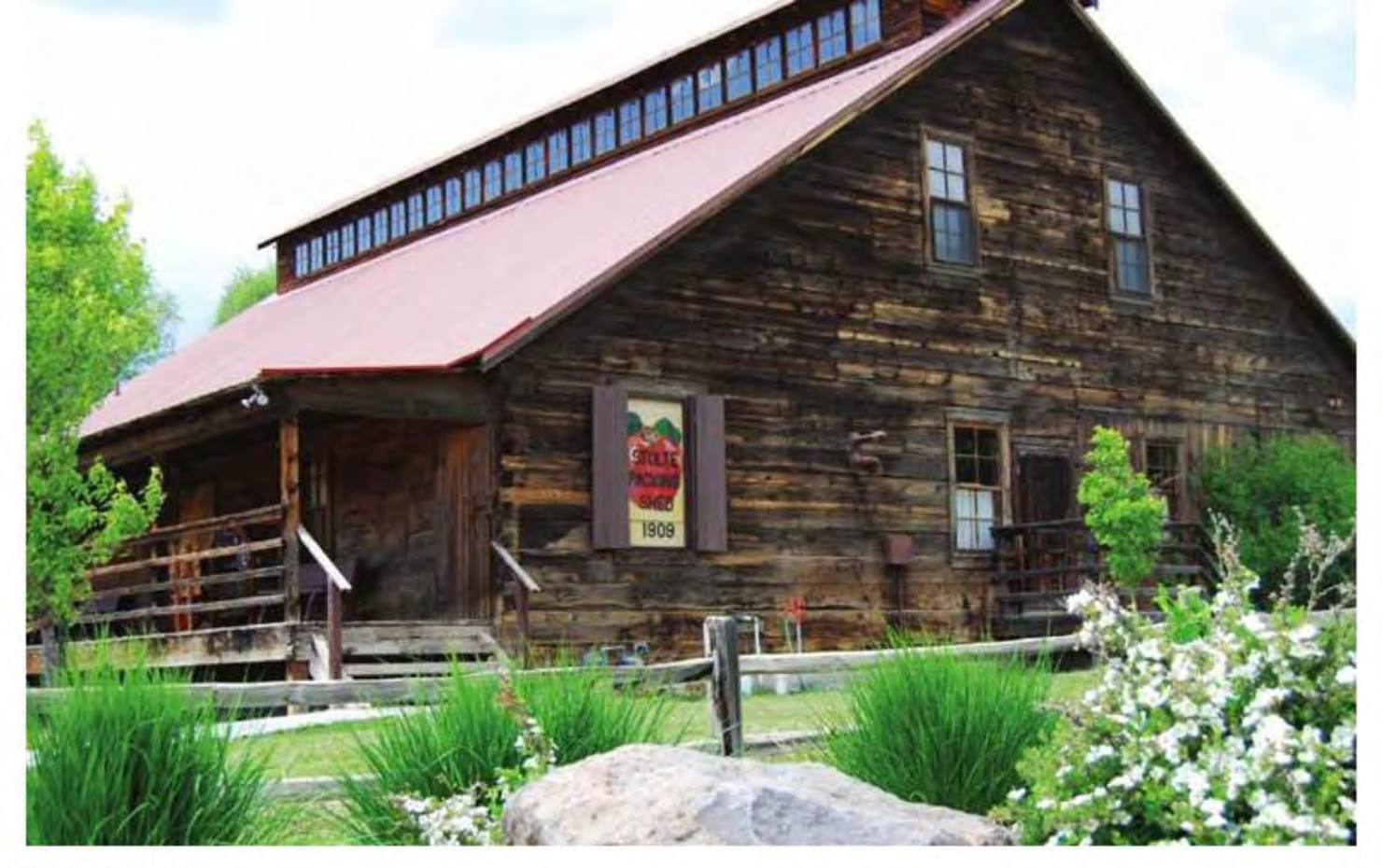
The Stolte Shed.

The award-winning Chapel of the Cross is a simple, but beautiful church, built in prairie style architecture, and is situated in a park-like setting. It is an ideal place for a memorable event. Together with the Stolte Shed, an original packing shed that was relocated from the Stolte orchard, the buildings present the perfect venues for weddings and receptions. Both are available for rental year-round.