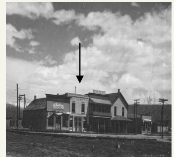
Bolton & Smith Bldg Date: About 1920 Cedaredge Hotel to the right; Champion Newspaper to the left.

(This research was conducted, in part, by the CHS Colorado History Class.)