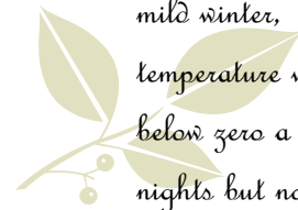
PHOTO BULLETIN BOARD

“ 1940: A rather mild winter, temperature went below zero a few nights but no winter kill to fruit buds.”