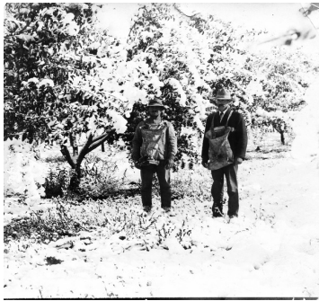
Apples and Snow at Eckert Date: Unknown Collection: Motto