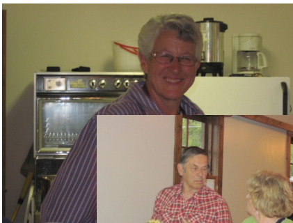
Volunteer Appreciation Dinner October 18, 2011